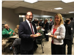
EBA Veterans Day Celebration