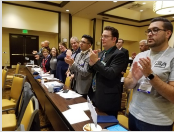
EBA Members representing us well at the ISBA House of Delegates Annual Meeting.