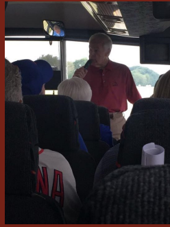
Cardinals CLE Bus Trip