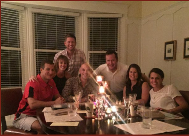
Fun for a Good Cause