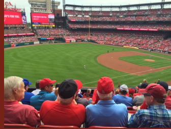
Senior Lawyers Social