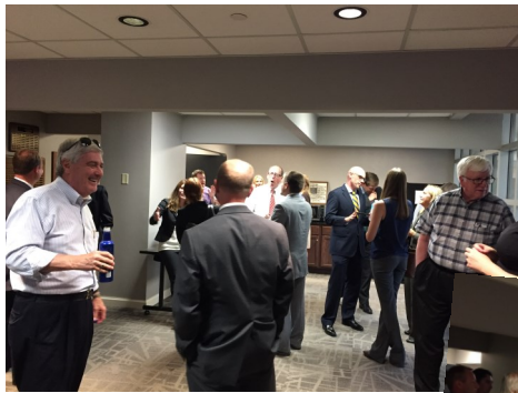
EBA Annual Meeting

P.O Box 1779 Newburgh, IN 47629 (812) 459-0534 dvm2433@gmail.com