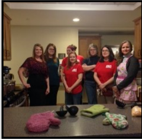
Members of the Paralegal Section volunteered at the Ronald McDonald House making a Meal of Love for the families staying there Friday, March 2